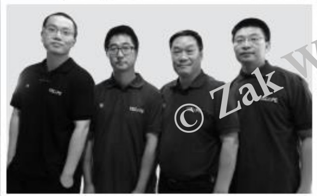
VSCAPE / Viridian China Team